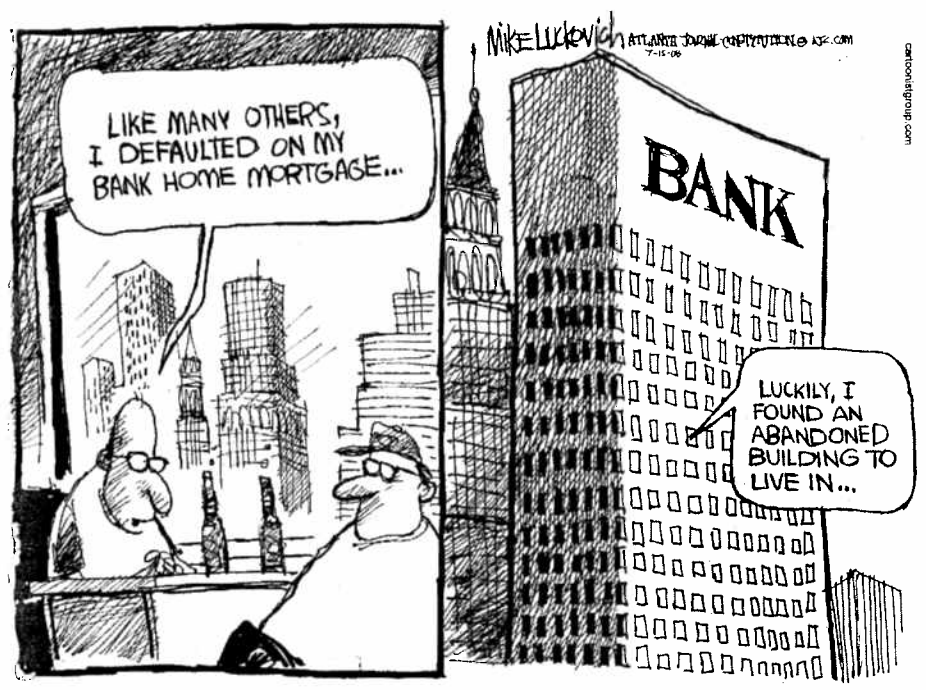
Mike Luckovich Editorial Cartoon ©2008 Mike Luckovich. Used with the permission of Mike Luckovich and Creators Syndicate. All rights reserved.

Some of the core false representation violations do not occur upon filing of the collection complaint, or even if they appear to, may initially be of marginal quality. However, those deceptive, unsubstantiated, and sham allegations in the collection complaint